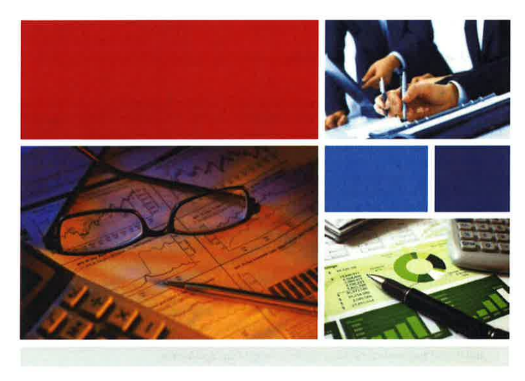
Los Angeles County Treasury Independent Accountant's Report on Applying Agreed-Upon Procedures September 30, 2013